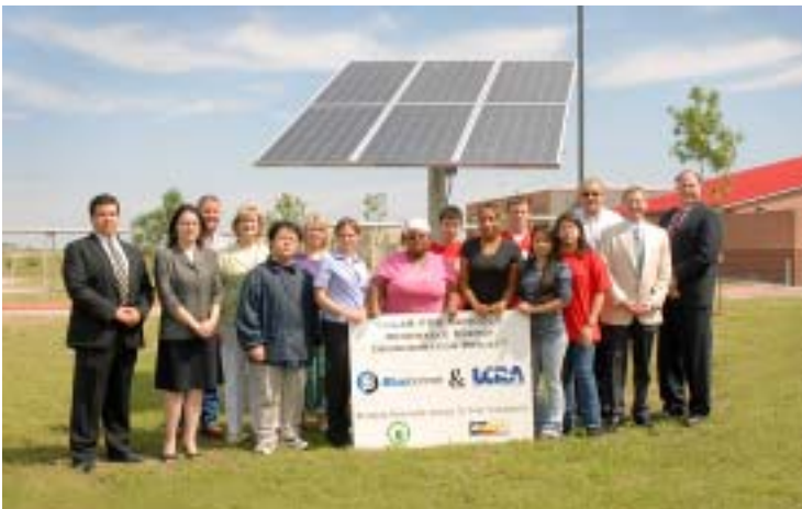
Dedication ceremony at Manor Middle School sponsored by Bluebonnet Electric Cooperative. Pictured are students, teachers, the principal, school district superintendent, electric cooperative and LCRA representatives.

In all cases, the community supported the installation of these photovoltaic systems through city council or board approval. Most installations are in rural Texas communities where students had never actually seen a photovoltaic system, and some were unaware