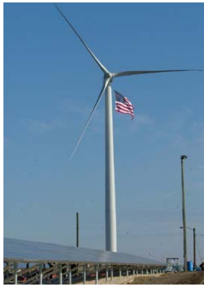
ACUA Wind turbine and solar array

By incorporating clean renewable energy into its operations the ACUA has significantly reduced its dependence on fossil fuels and increased its energy security. The project is proving that renewable energy is a viable source of power that has a place in all sectors — including government and industry.