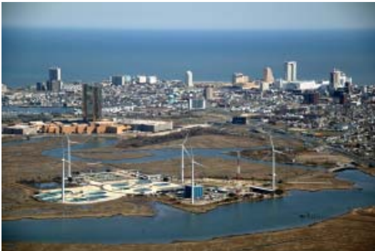
ACUA wind power project at the Atlantic City wastewater treatment facility.

Education and outreach are top priorities at the ACUA and share their renewable experience with others. The ACUA has always been an educational destination for local schools who visit its recycling facility and landfill gas-to-electricity project. With the completion of the wind farm, tours are available for the wind farm and solar project. The ACUA also conducts presentations at New Jersey schools, civic groups and other venues. An educational kiosk was constructed on site that provides information on the wind farm and all the renewable energy projects in which the ACUA is involved.