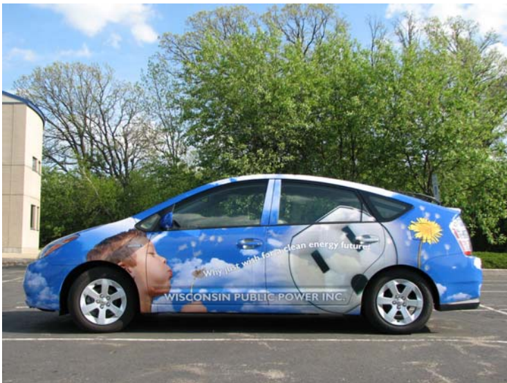
One of WPPI's PHEV fleet featuring a design from its current renewable energy marketing campaign.

Although PHEVs are not yet widely available, WPPI's vehicles are demonstrating that plug-in vehicle technology is a solution automakers can and should develop today using existing technology and no new infrastructure. ❖